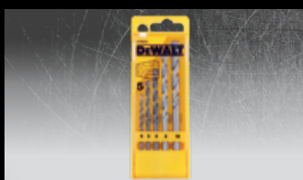
DT6952 5-PIECE CONCRETE DRILLING SET 5 pieces in plastic case, diameters 4, 5, 6, 8, 10 mm