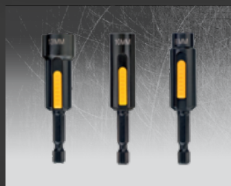
DT7460 3-PIECE CLEANABLE HEXAGONAL MAGNETIC SOCKET DRIVER Sizes 8, 10, 13 mm