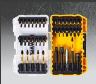
DT70733T 38-PIECE FLEXTORQ SCREWDRIVING SET-PH,TX