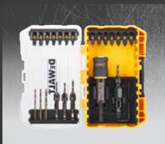
DT70779T 22-PIECE FLIP AND DRIVE SET 22-piece set of Flip and Drive bits, screwdriving bits, drill bits and countersinks