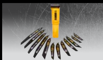
DT2441L 12-PIECE SAW BLADE SET 12-piece set of EXTREME LONG LIFE saw blades for wood and metal for reciprocating saws