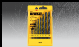
DT5911 10-PIECE HSS-R METAL DRILLING SET Set includes 1, 2, 3, 4, 5, 6, 7, 8, 9, 10 mm bits