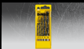
DT4535 5-PIECE WOOD DRILLING SET Diameters 4, 5, 6, 8, 10 mm