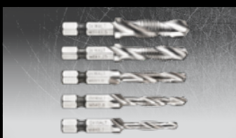
DT50060 5-PIECE IMPACT READY DRILL TAPS Diameters M4, M5, M6, M8, M10