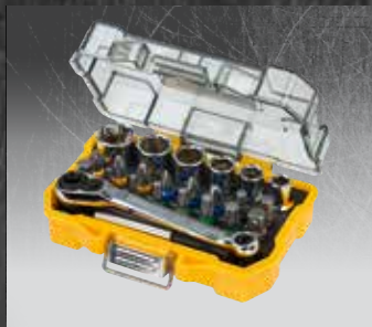
DT71516 SOCKET SET 1/4" 24-piece set of durable sockets and accessories for screwdriving