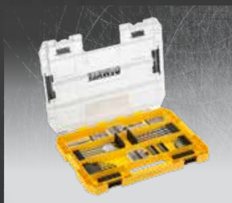
DT70763 85-PIECE OF SCREWDRIVING EXTENTIONS AND DRILLING SET