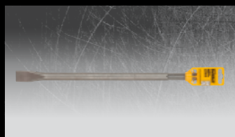
DT60704 SDS MAX FLAT CHISEL 25 X 400 MM