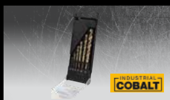
DT4956 6-PIECE COBALT METAL DRILLING SET EXTREME® Diameter 2, 3, 4, 5, 6, 8 mm, length 49-117 mm