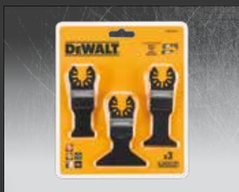
DT20760 3-PIECE SET OF OSCILLATING SAW BLADES