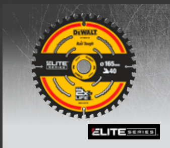
DT10640 CIRCULAR SAW BLADE 165 x 20 mm, 40 teeth, ATB 18°