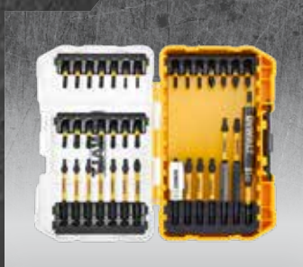
DT70732T 37 - PIECE FLEXTORQ SCREWDRIVING SET - TORX