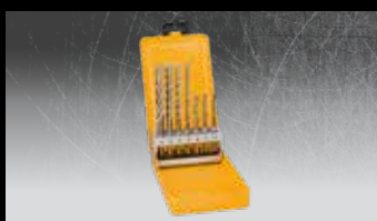
DT9701 7-PIECE SDS PLUS EXTREME® DRILLING SET 7 parts in metal case, 5, 2x6, 2x8, 10, 12 mm