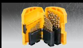
DT7926 29-PIECE METAL DRILLING SET EXTREME®, HSS-G