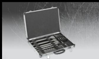
DT9679 15-PIECE SDS PLUS DRILLING SET AND CHISEL SET