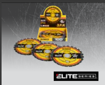
DT10402 CIRCULAR SAW BLADE 190 x 30 mm, 24 teeth, ATB 18°