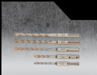
DT60301 5-PIECE SDS PLUS DRILLING SET 5x110mm, 6x110mm, 6x160mm, 8x160mm, 10x160mm