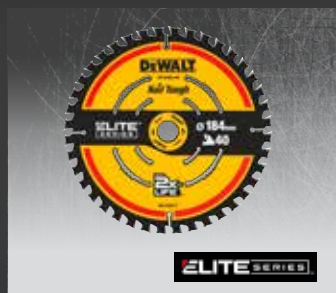
DT10303 CIRCULAR SAW BLADE 184 x 16 mm, 40 teeth, ATB 18°