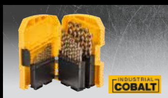
DT4957 29-PIECE COBALT METAL DRILLING SET EXTREME®