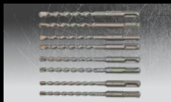
DT60300 8-PIECE SDS PLUS DRILLING SET two 6mm, two 7mm, two 10mm