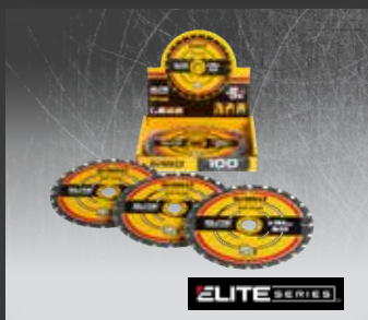
DT10401 CIRCULAR SAW BLADE 184 x 20 mm, 24 teeth, ATB 18°