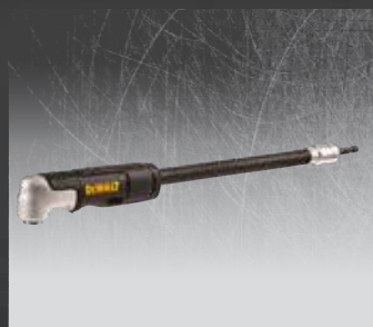
DT20502 IMPACT MODULAR RIGHT ANGLE ATTACHMENT AND FLEXI ATTACHMENT