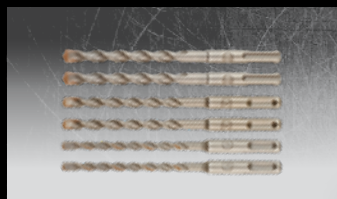
DT60302 6-PIECE SDS PLUS DRILLING SET two 6mm, two 7mm, two 10mm, bit length 160mm