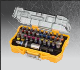
DT7969 32 - PIECE SCREWDRIVING SET