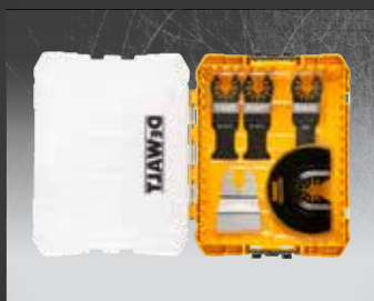
DT20761 5-PIECE SAW BLADE SET