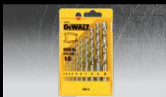
DT5921 10-PIECE HSS-G METAL DRILLING SET Drill bit Ø: 1, 2, 3, 4, 5, 6, 7, 8, 9, 10 mm