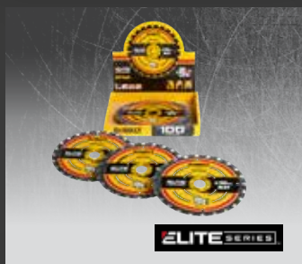
DT10400 CIRCULAR SAW BLADE 165 x 20 mm, 24 teeth, ATB 18°