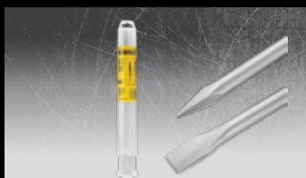
DT9000 2-PIECE SDS MAX CHISEL SET Flat 25 x 400 mm and pointed 400 mm