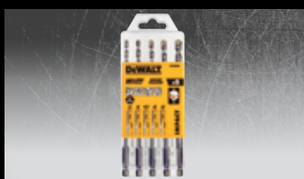
DT60099 5-PIECE MASONRY DRILLING SET The set includes drills with diameters 4, 5, 5.5, 6, 8 mm, total length 152 mm,