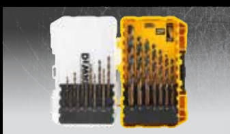
DT70728 19-PIECE METAL DRILLING SET HSS-G BLACK & GOLD® 1, 1.5, two 2.5, two 3, two 3.5, two 4, two 5.5, 6, 7, 8, 10mm