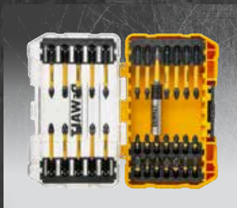
DT70730T 26 - PIECE FLEXTORQ SCREWDRIVING SET - PH, TX